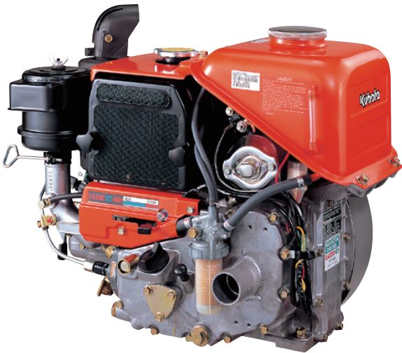
Photograph may show non-standard equipment.